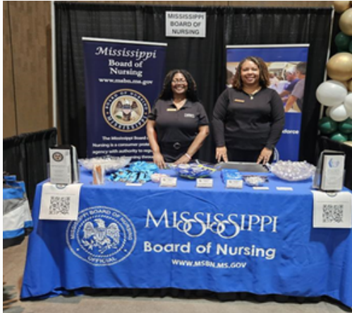
MNA Convention October 2024