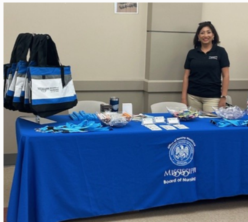
Pearl School District Job Extravaganza April 2025