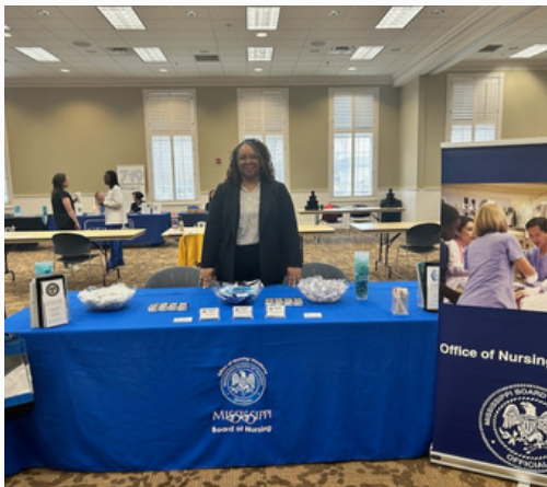
NWCC LPN Career Expo March 2025