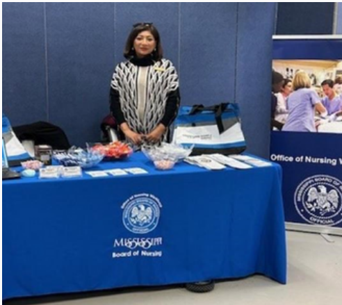
Madison County Job Extravaganza February 2025