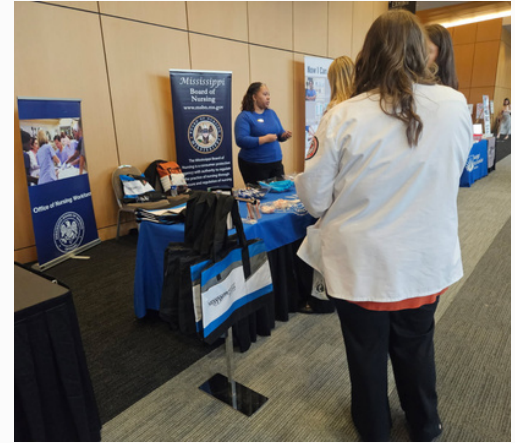
Legislative Nursing Summit February 2025