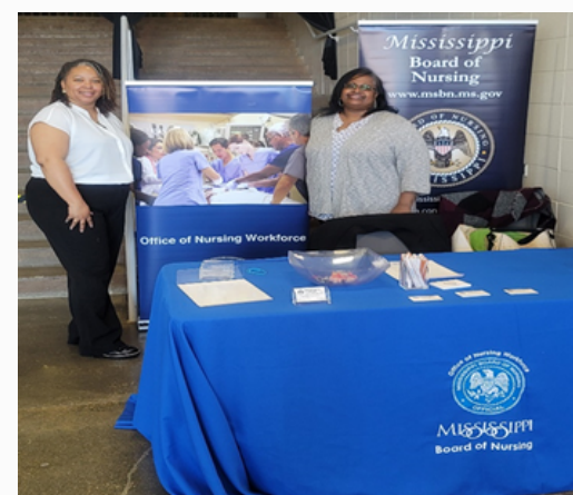
MOADN Convention April 2025