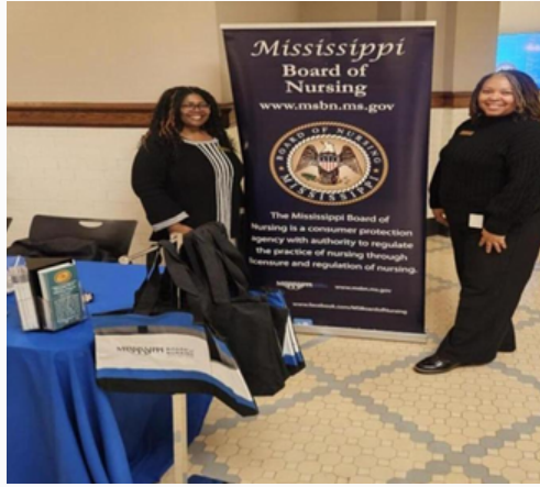
Capitol Day January 2025